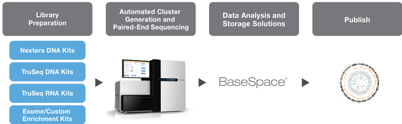
Figure 3: A Complete Sequencing Solution. The HiSeq 3000/HiSeq 4000 Systems are part of a complete sequencing workflow that includes library preparation, sequencing, and data analysis.